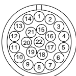
22 PIN FEMALE MATING FACE